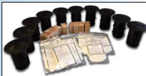
Demise™ Termite Detection and Elimination Systems