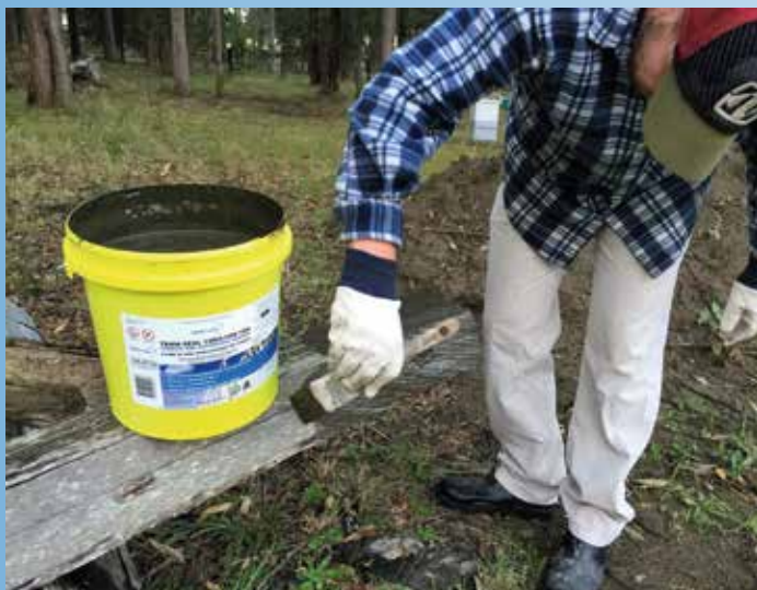
Creo-Fen Ten Coated Fence post