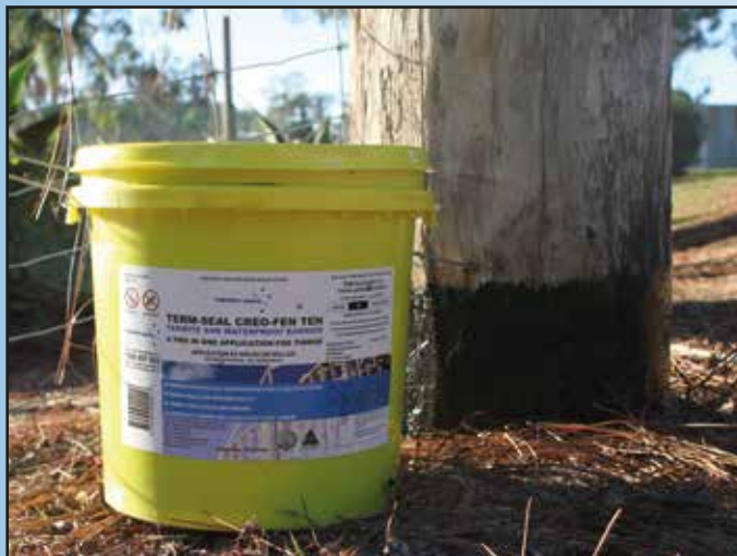
Paint or dip coat your timber posts, poles or structures