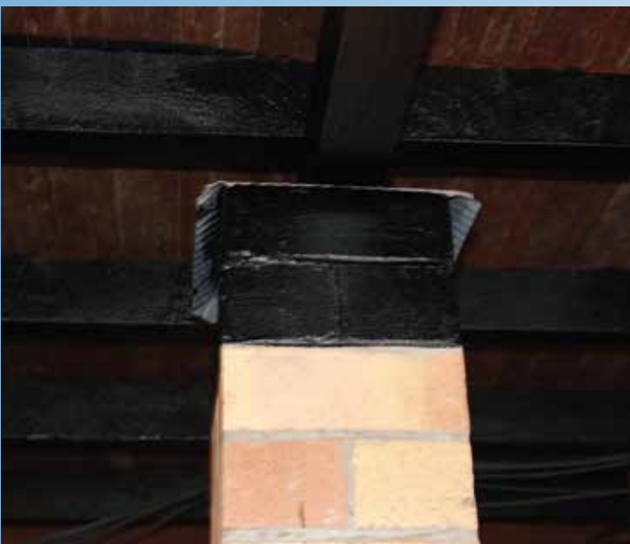
Creo-Fen Ten as a pier, bearer and Joist termite barrier to existing subfloors