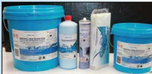
Aqua Block termite-proof barrier

See our other Specialty Pest Control Products: