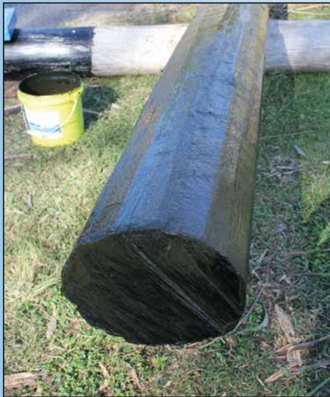
Creo-Fen Ten Coated Timber Post