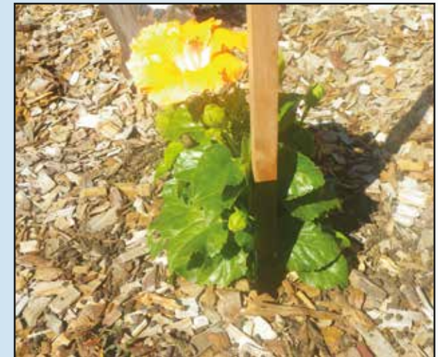
Creo-Fen Ten Coated Stake