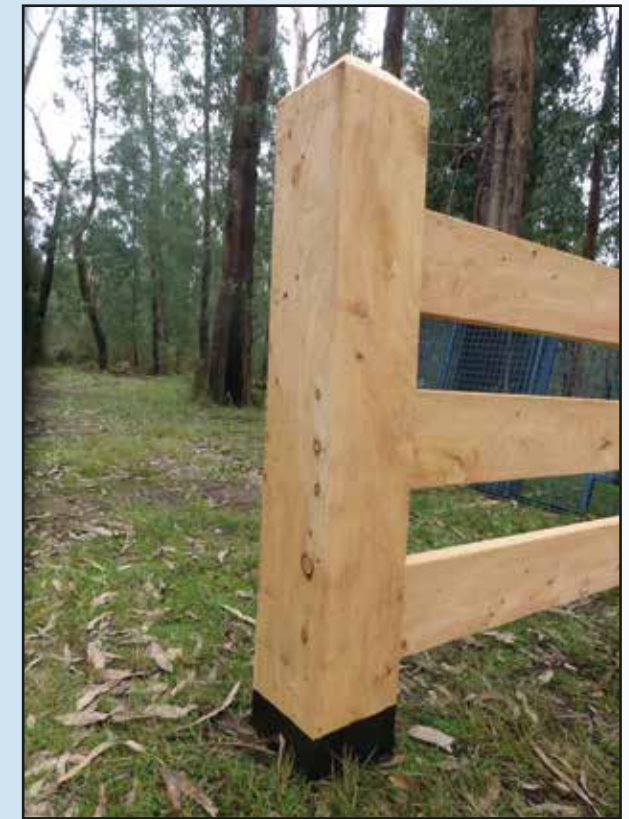
Fence by Golden Cypress treated with Creo-Fen Ten